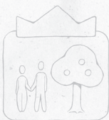
creation ~ made

Then I saw a new heaven and a new earth, for the first heaven and the first earth had passed away, and there was no longer any sea. 2 I saw the Holy City, the new Jerusalem, coming down out of heaven from God, prepared as a bride beautifully dressed for her husband. 3 And I heard a loud voice from the throne saying, "Now the dwelling of God is with men, and he will live with them. They will be his people, and God himself will be with them and be their God. 4 He will wipe every tear from their eyes. There will be no more death or mourning or crying or pain, for the old order of things has passed away."