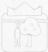
jesus ~ shown

Jerusalem is God's city and the bride is a picture of God's special relationship with his people. God promises that people will know him and live in his new world.