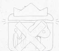
rebellion ~ spoiled