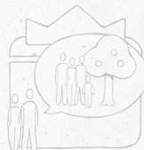
church ~ announced