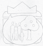
abraham ~ promised