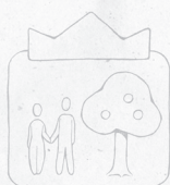
creation ~ made

30 At once Jesus realised that power had gone out from him. He turned around in the crowd and asked, “Who touched my clothes?” 31 “You see the people crowding against you,” his disciples answered, “and yet you can ask, ‘Who touched me?’” 32 But Jesus kept looking around to see who had