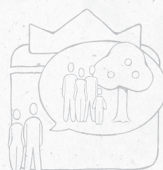
church ~ announced