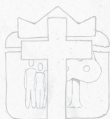
cross ~ achieved