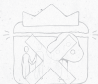
rebellion ~ spoiled