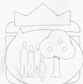
abraham ~ promised