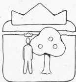
Jesus ~ shown