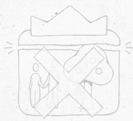
rebellion ~ spoiled