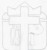
cross ~ achieved