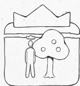
Jesus ~ shown

It was written by a man called Mark, who knew people who had seen these events and probably saw some of them himself. Mark tells us about a man called Jesus who lived about 2,000 years ago.