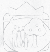
abraham ~ promised