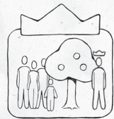
new creation ~ finished