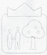
creation ~ made

6 The angel said to me, "These words are trustworthy and true. The Lord, the God of the spirits of the prophets, sent his angel to show his servants the things that must soon take place."