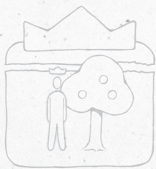
jesus ~ shown