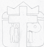
cross ~ achieved