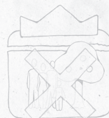
israel ~ failed