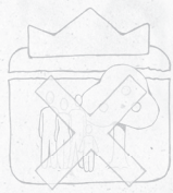
israel ~ failed